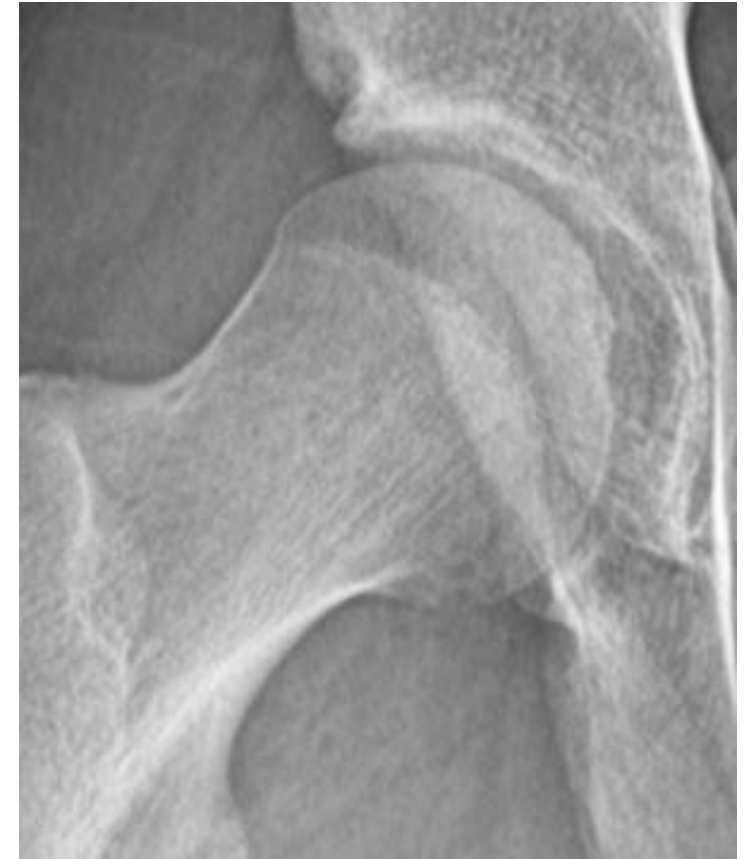
2 Year Postop