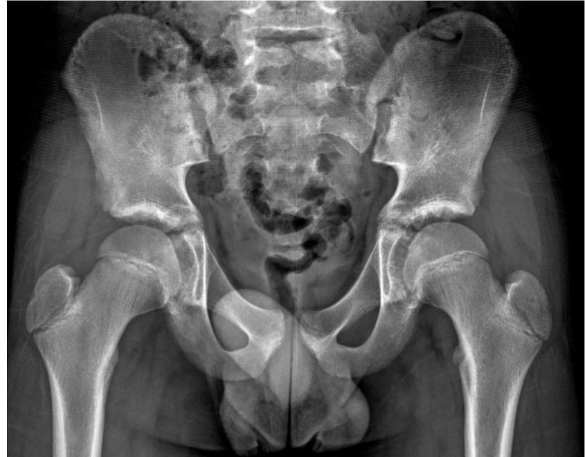
Preoperative radiograph with open proximal femoral physis.