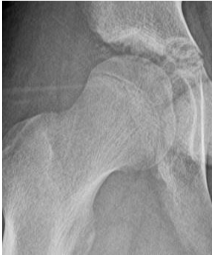
2 Week Postop