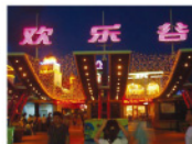
City Tour 4: SHanghai Happy Valley TBD